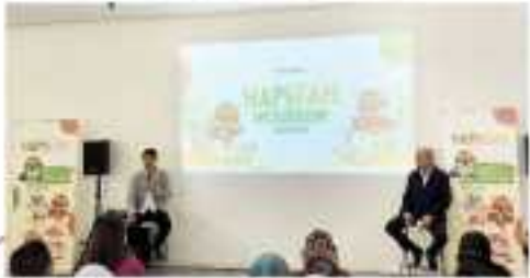
Backdrop & Bunting