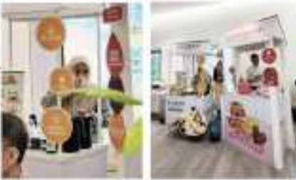
Coral Bar & Cuskie Bar