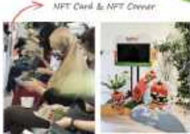
NFT Card & NFT Cover